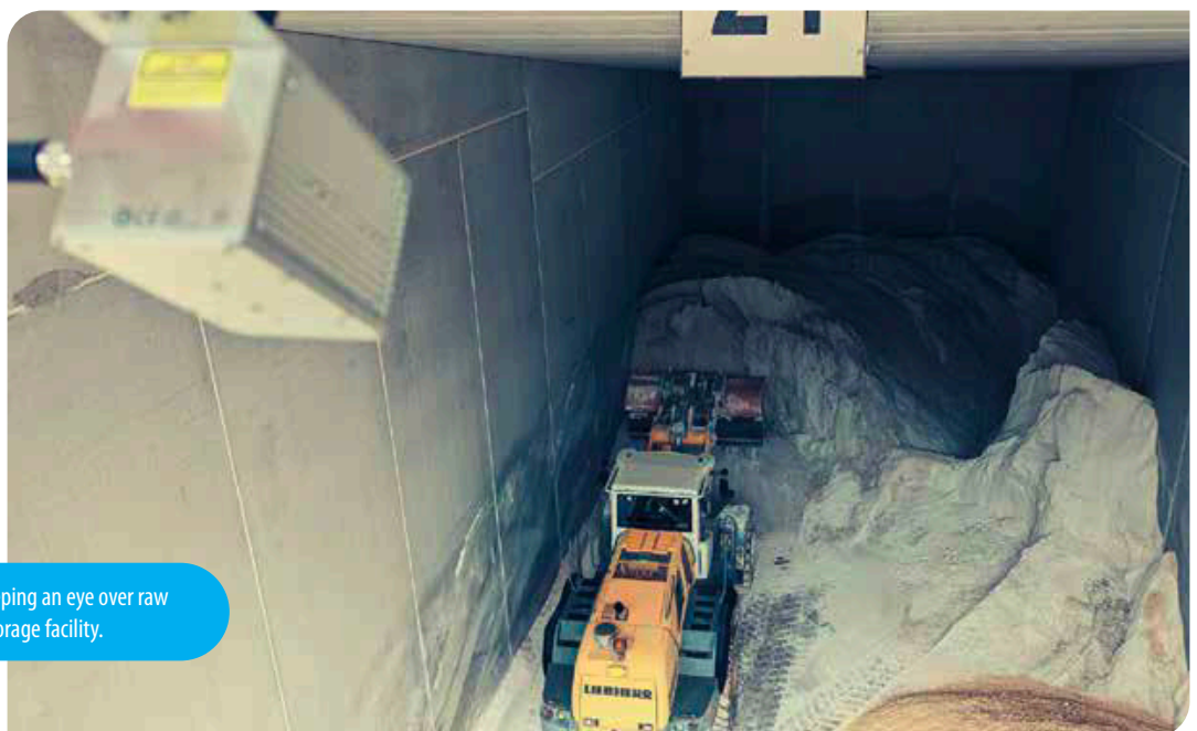
An Owl Eye Monitoring System keeping an eye over raw materials in a covered outdoor storage facility.

A key question to ask is whether to depend on one single sensor manufacturer or choose software that